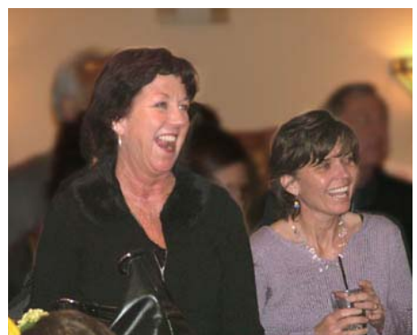
Great Food... Great Drink... Great Time!