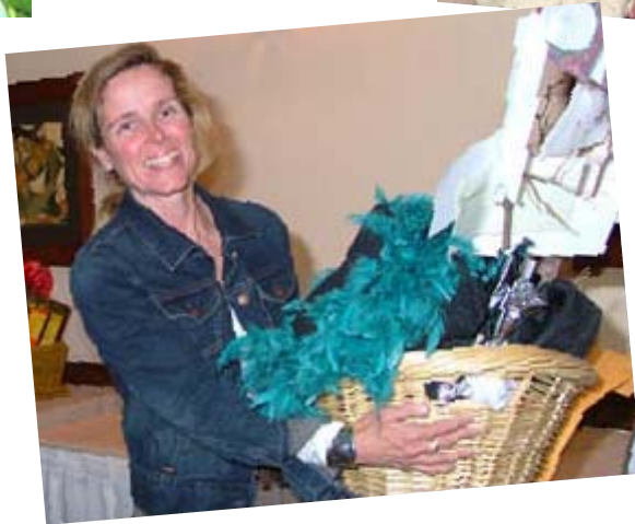
A Happy Basket Winner